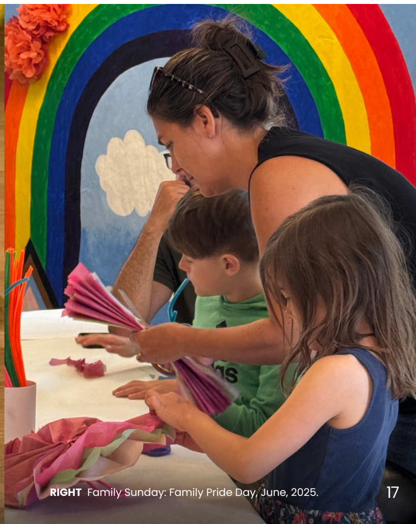
RIGHT Family Sunday: Family Pride Day, June, 2025.