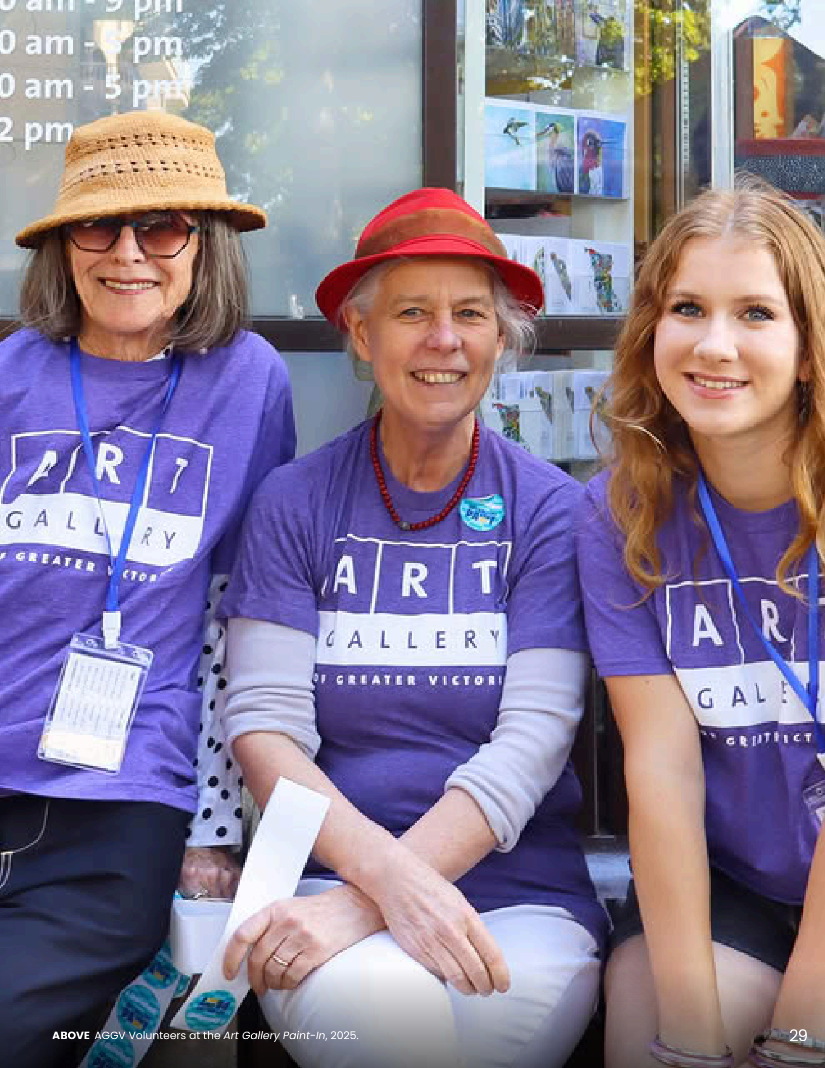
ABOVE AGGV Volunteers at the Art Gallery Paint-In, 2025.