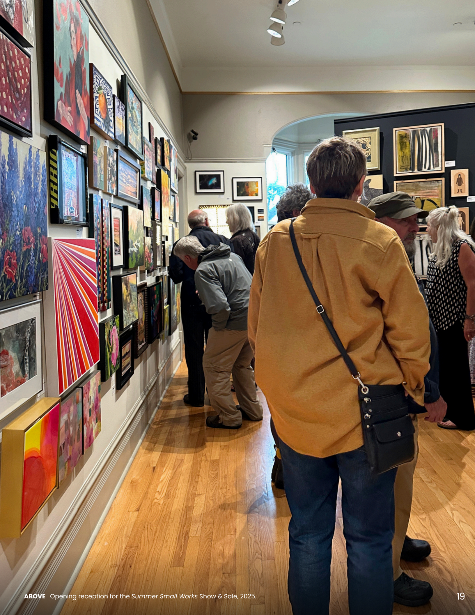
ABOVE Opening reception for the Summer Small Works Show & Sale , 2025.