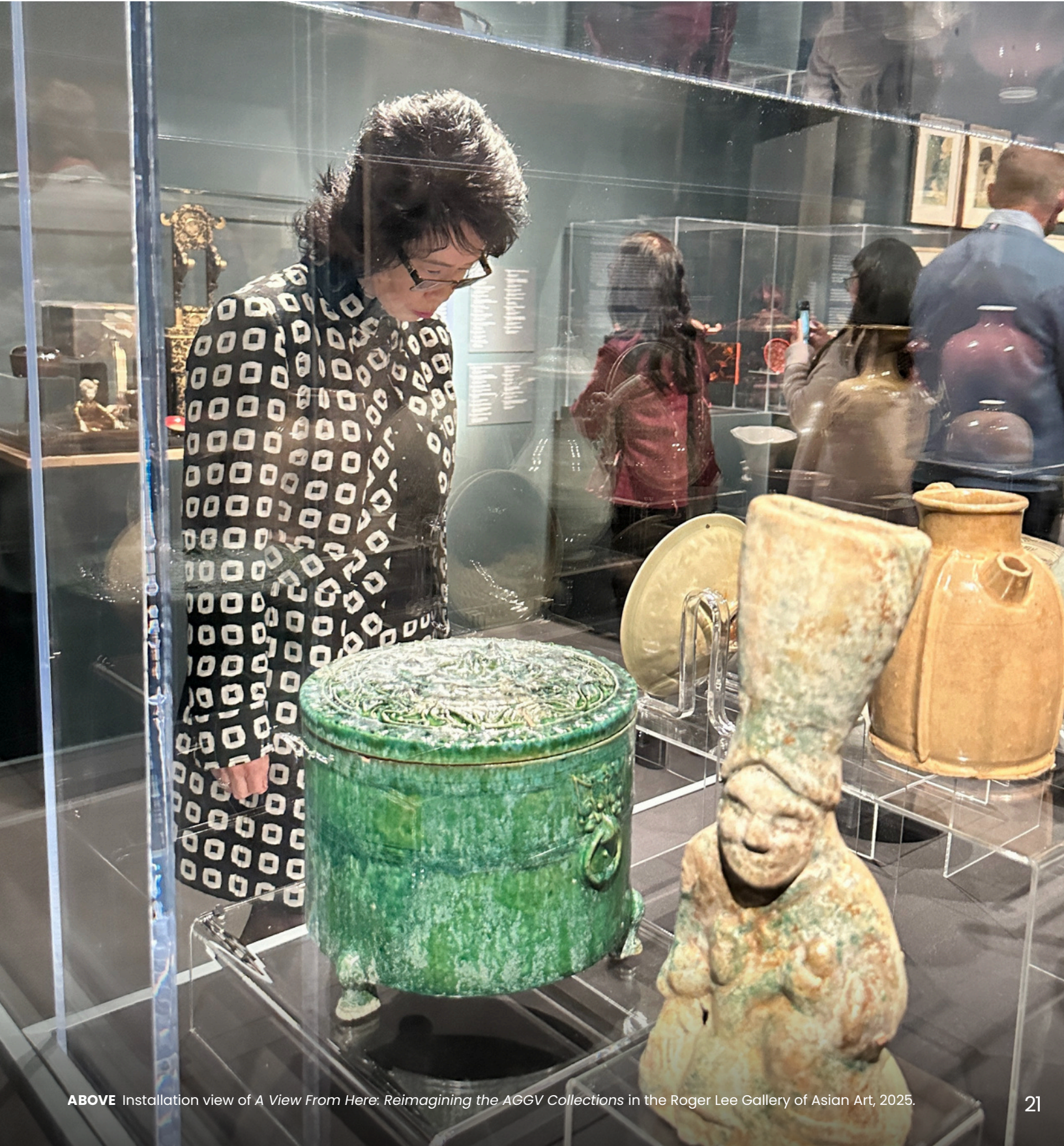
ABOVE Installation view of A View From Here: Reimagining the AGGV Collections in the Roger Lee Gallery of Asian Art, 2025.

Since its founding, the AGGV has acquired work from around the Pacific Rim and has established one of the finest collections of Asian art in Western Canada.