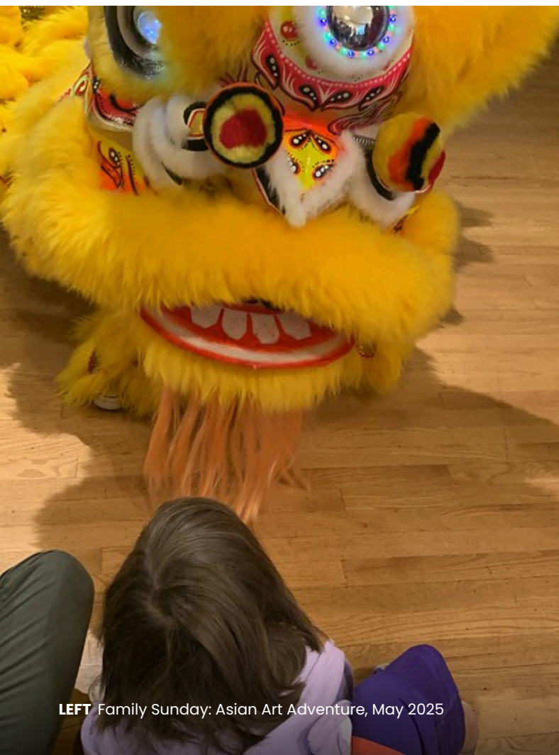
LEFT Family Sunday: Asian Art Adventure, May 2025