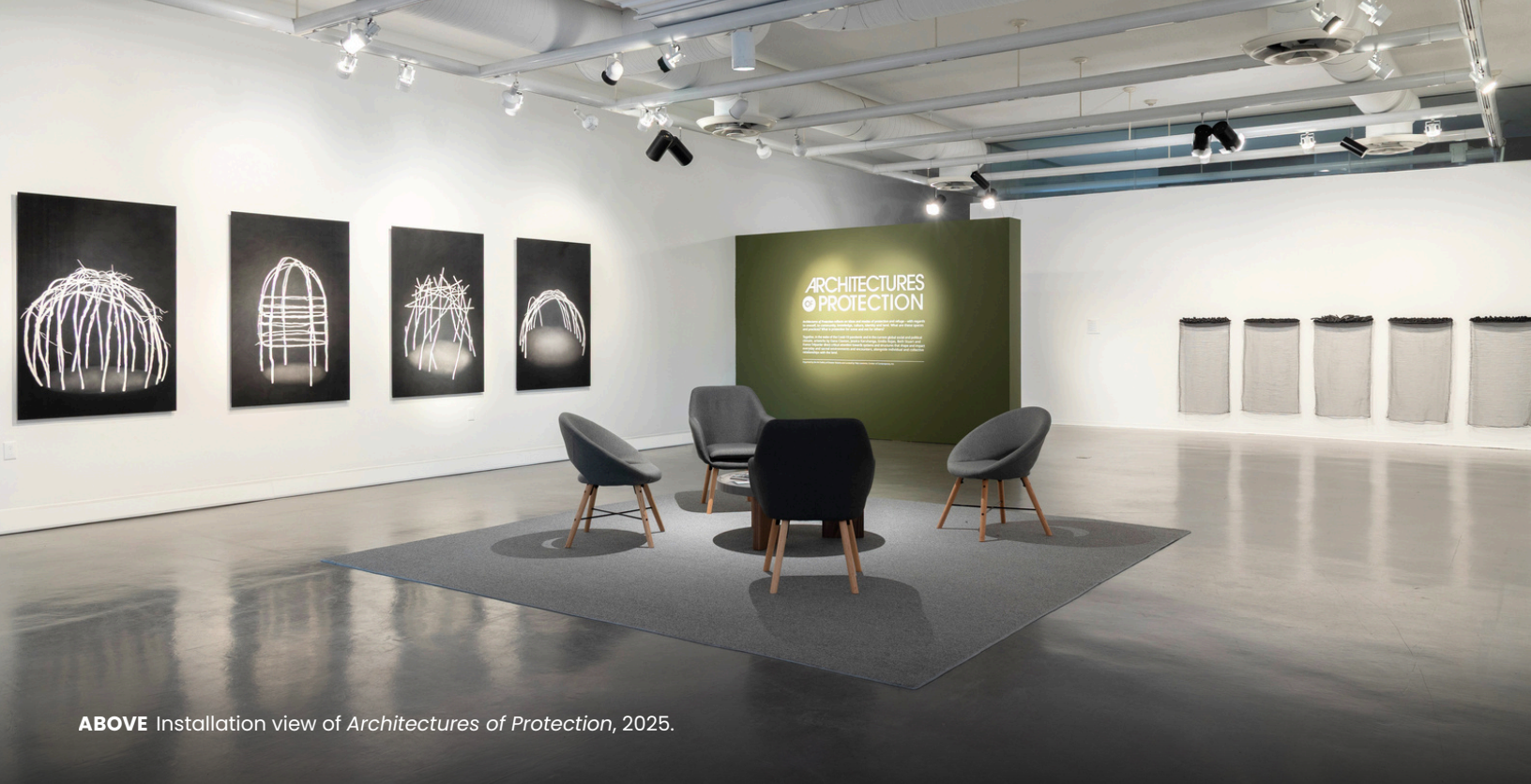
ABOVE Installation view of Architectures of Protection , 2025.