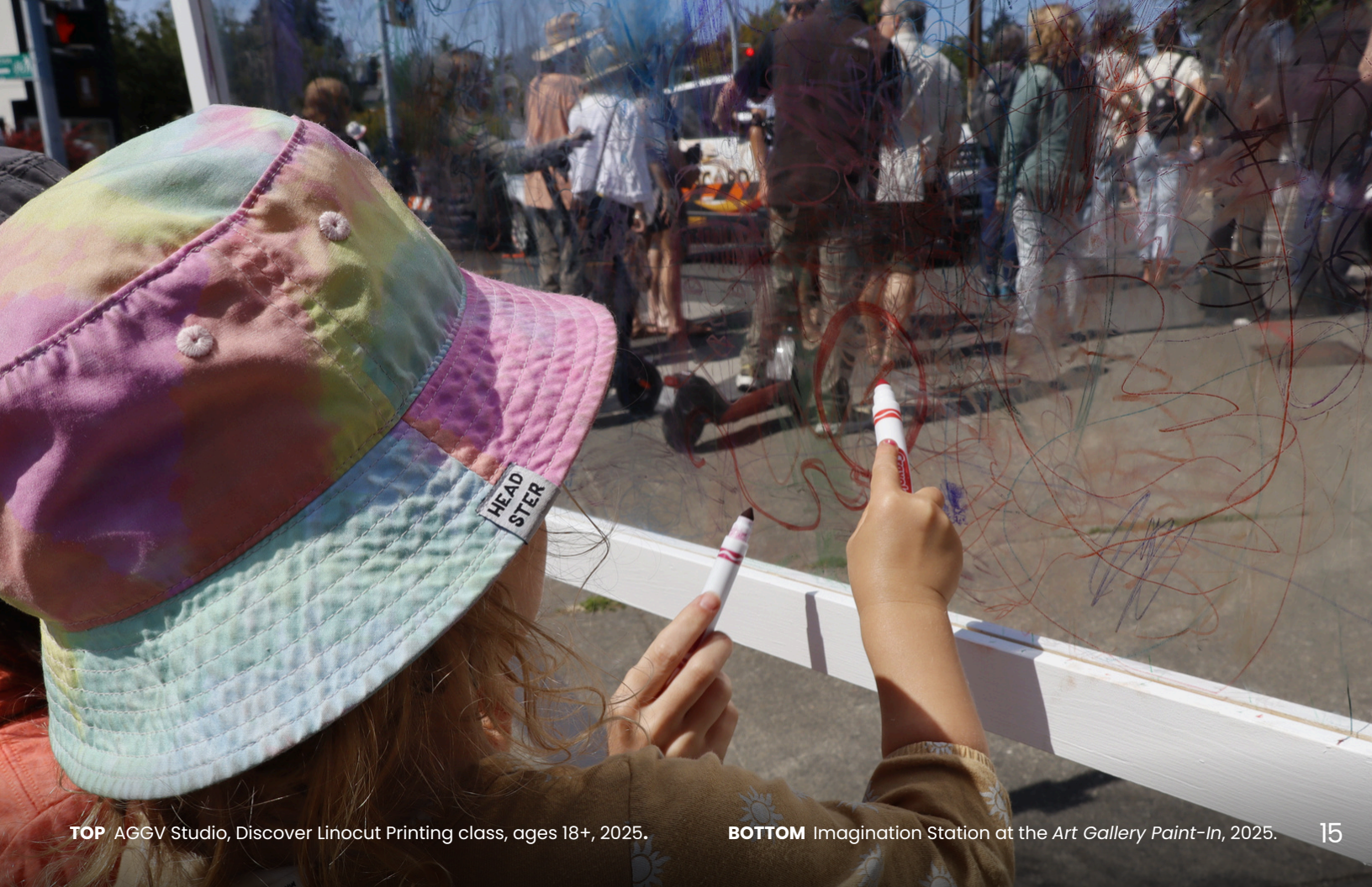
TOP AGGV Studio, Discover Linocut Printing class, ages 18+, 2025.