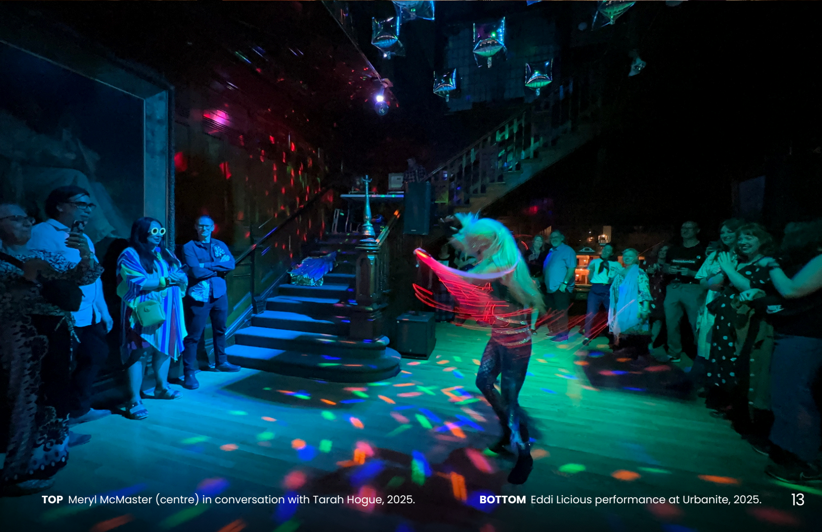
BOTTOM Eddi Licious performance at Urbanite, 2025.