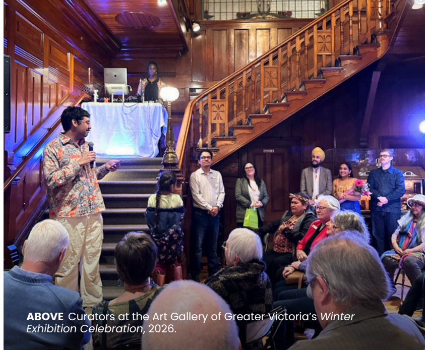
ABOVE Curators at the Art Gallery of Greater Victoria's Winter Exhibition Celebration, 2026.

Thank you to our Donors, Sponsors, and Partners. Your support makes an immediate and lasting difference to the AGGV. Contributions from our donors to the Annual Fund and sponsorship from our partners support our programming, exhibitions, and events.