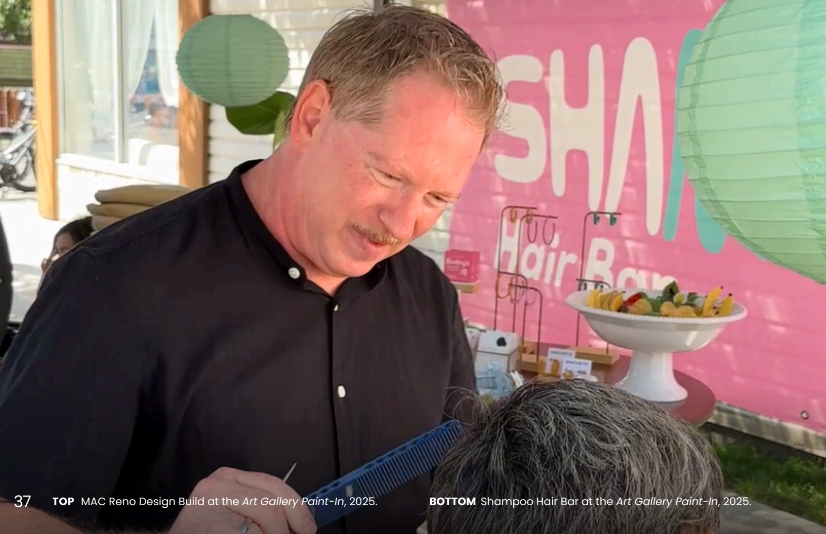
37 TOP MAC Reno Design Build at the Art Gallery Paint-In, 2025.