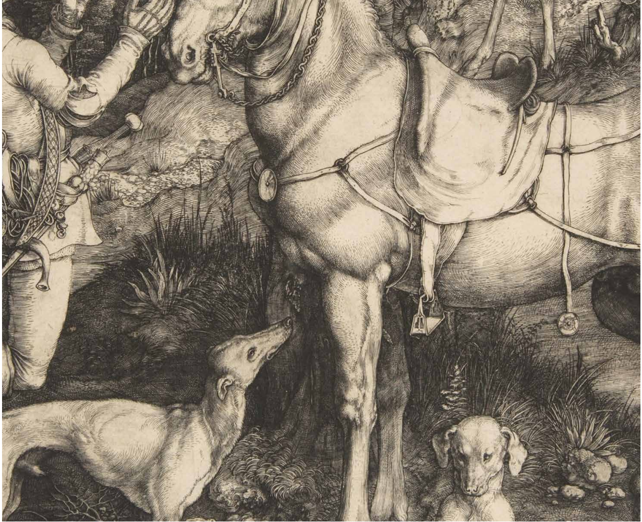
Albrecht Dürer | St. Eustace (detail) | ca. 1500–1502 | AGGV1964.188.001