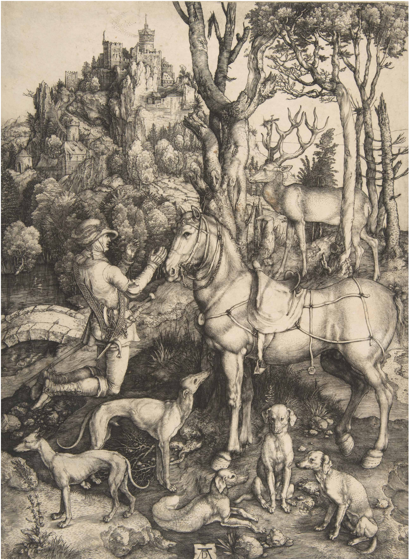
Albrecht Dürer | St. Eustace | ca. 1500–1502 | AGGV1964.188.001