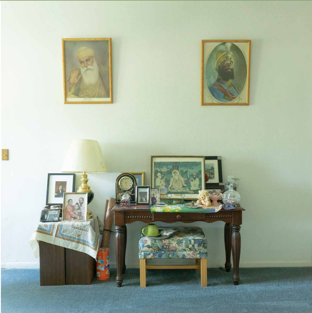
Simranpreet Anand | चैठक (the blue room) | 2022 | Digital photograph